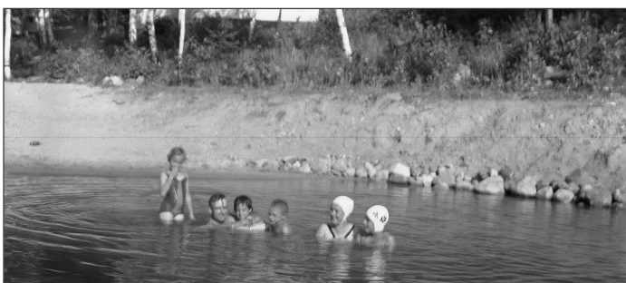
Ray's aunt, uncle and cousins in the Deer Trail swimming area ~ 1959 (Remember swim caps?)